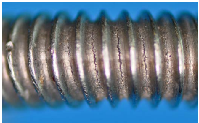
Fig. 2. Cracks are clearly visible in this close-up in the area of the bend.