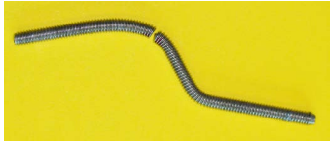
Fig. 1. This picture shows the broken actuator rod removed from the incident aircraft.

One exacerbating factor was that the Pioneer trim operating rod was manufactured from threaded bar where the root of the thread was acting as a stress