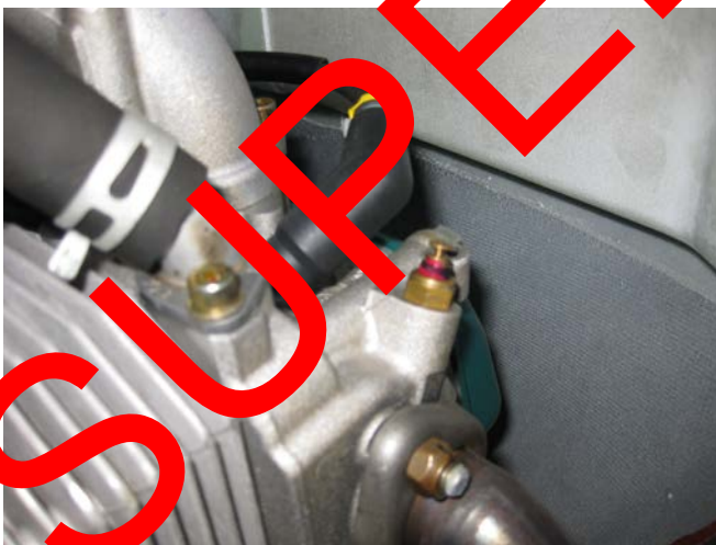
Fig. 2. Picture showing a post 2013 cylinder assembly designed to measure coolant temperature; note that the sensor faces up.

It is essential that a pilot is presented with appropriate and accurate information about the engine's performance and, most importantly, its operating temperature relative to the maximum allowable operating temperature.