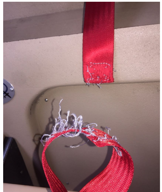
Fig. 1 (Above) shows a shoulder harness that failed during an accident involving an abrupt stop; though this harness has failed the energy absorbed by the belt during its failure contributed to a significant reduction in the level of head injury sustained by the pilot. Though this harness was over ten years old at the time of the failure, tests showed that a belt of similar age and examined quality still passed a pull test.