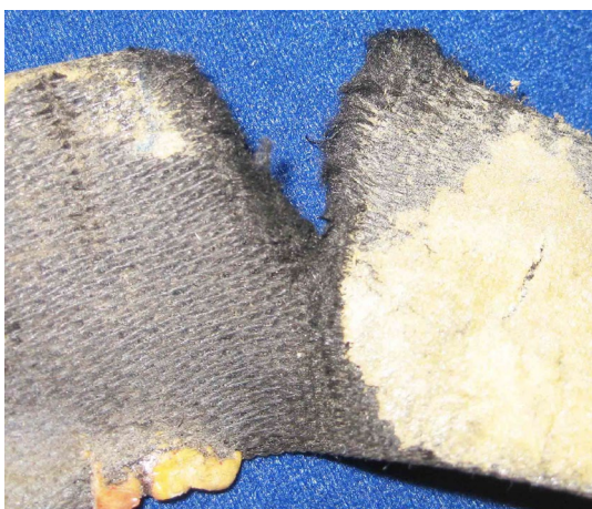
Fig. 2 (Left) is an example of lap strap that is clearly not serviceable – though, because this portion of the belt was 'hidden' within the aircraft's structure, the owner of the aircraft was not aware that it was badly worn through until a major inspection was carried out.